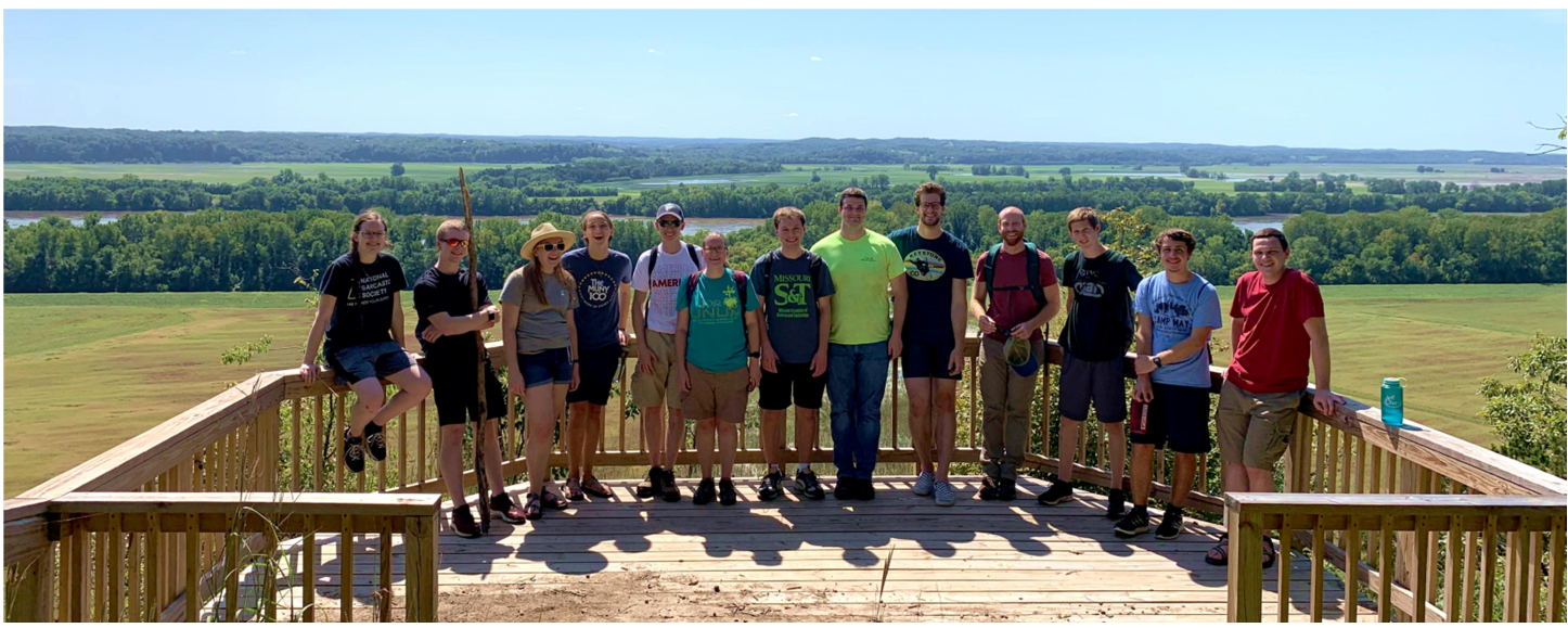
Above: Enjoying the view from the top of the bluff during our hiking trip.