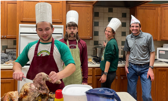
Preparing the food for our Thanksgiving Potluck