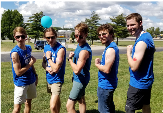
Showing off painted tattoos at the PRC Walk for Life