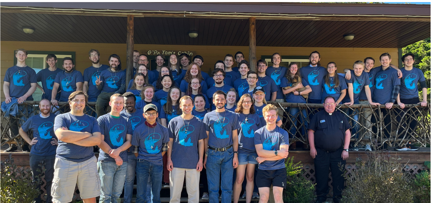
The group picture from this year's Awakening Retreat