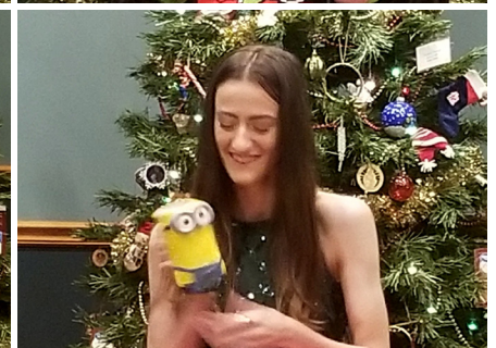
Students opening white elephant gifts during our Advent Party